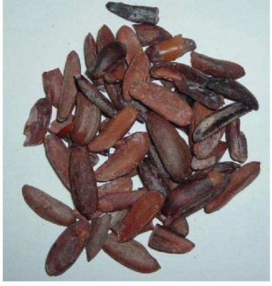
Madhuca Longifolia oil

http://www.ijesrt.com(C)International Journal of Engineering Sciences & Research Technology [3134-3137]